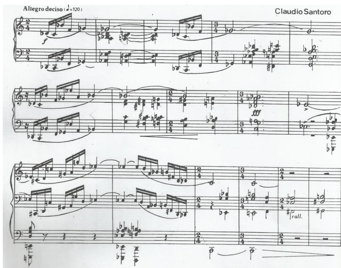
Figure 8: Claudio Santoro, Fourth Piano Sonata [mm. 1-16]

As seen in the next example (Fig. 8), CS 4 [mm. 1-16] is also based on the repetition of motifs and it too presents sixteenth note figurations in unison two octaves apart and placed at the lower to mid-range of the keyboard. The angularity of the intervals and the insistence on the repetitions are, nevertheless, more pressing in CS 3 and less so at CS 4. In spite of the warning deciso , motivic events are placed further apart and mediated by slower moving chords. As in the CS 3, chords provide color and support for the rapidly moving figuration in unison. The two-octave space between the hands is kept throughout this presentation supported by cluster-like undulating sonorities.