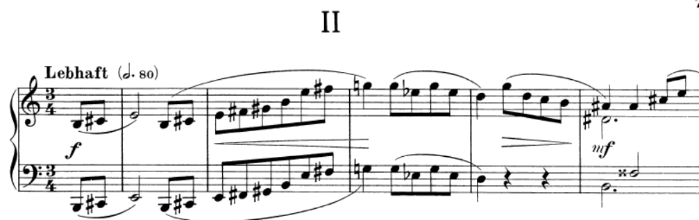
Figure 6: Hindemith's Second Piano Sonata , second movement [mm. 1-5]

The 'simple results' were not missed by the composer as attested by the employment of a two octave apart unison figuration 42 in the opening of the Second Movement of his Second of Three Piano Sonatas of 1936 (Fig. 6). In addition, while extensively discussing acoustics, the overtone series, scale formation and basic chord formation, Hindemith ascribes the highest generating power of resonance to the octave, the resulting interval maintained throughout the sounding of the unison figure.