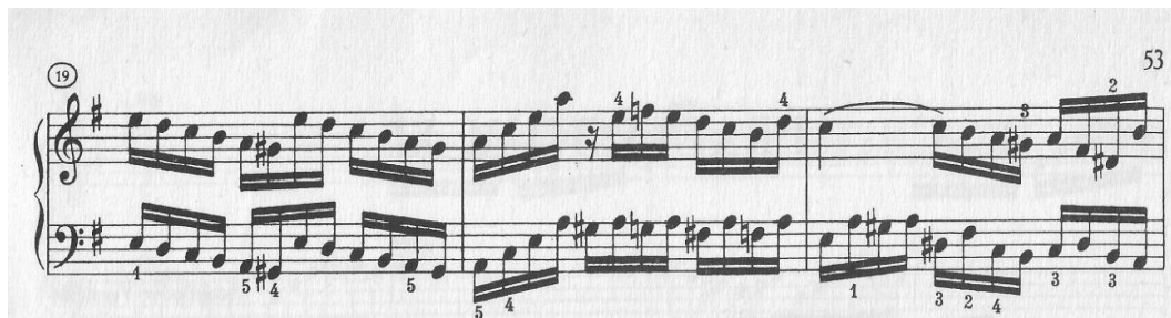
Figure 4: E minor Fugue from the Well Tempered Clavier [mm. 19-21]

As previously mentioned, the first movements of the following piano sonatas: CS 3, CS 4, ES, EC and EK 2 begin with statements built primarily on unison figurations showing allegiance to an international style of musical writing distanced from overt national characteristics. The unison has enjoyed the favor of composers even at the height of polyphonic writing; unison passages spaced two octaves apart mark the unity and cohesion of the argument as in J. S. Bach's E minor Fugue (WTC I, Schmieder-Verz, 855).