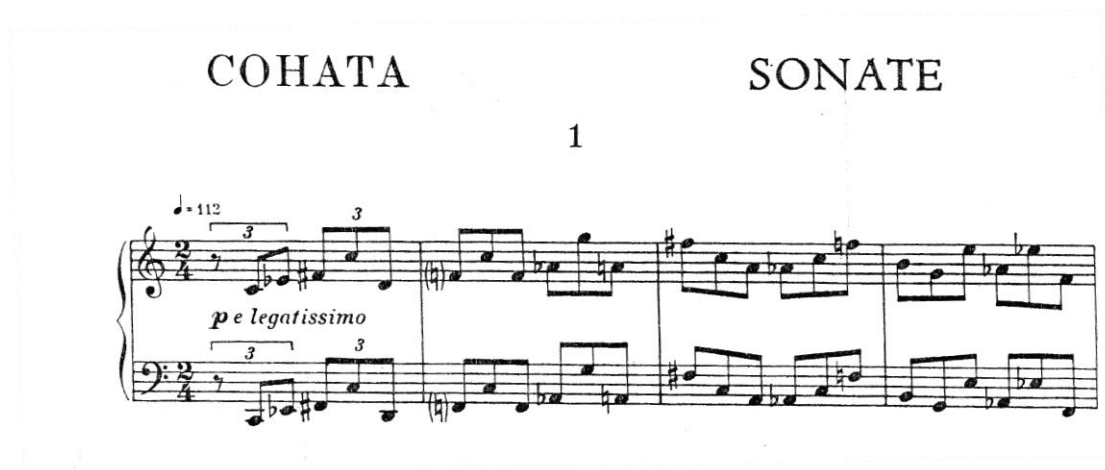
Figure 5: Stravinsky's Piano Sonata (1924) [mm. 1-4]

The 'simple results' were not missed by the composer as attested by the employment of a two octave apart unison figuration 42 in the opening of the Second Movement of his Second of Three Piano Sonatas of 1936 (Fig. 6). In addition, while extensively discussing acoustics, the overtone series, scale formation and basic chord formation, Hindemith ascribes the highest generating power of resonance to the octave, the resulting interval maintained throughout the sounding of the unison figure.