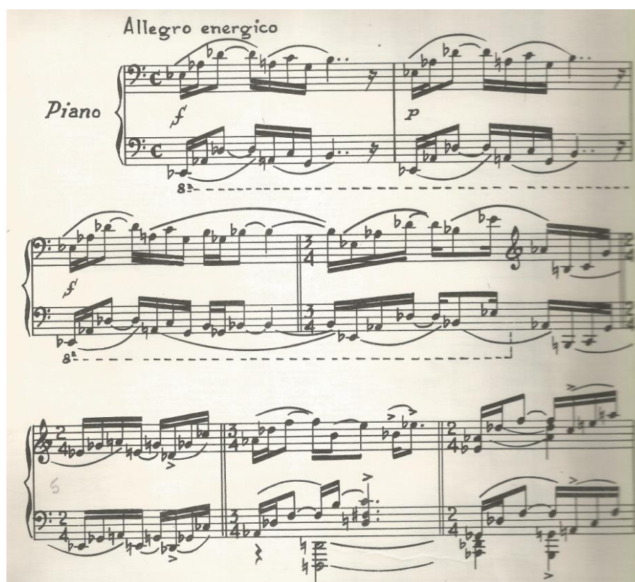
Figure 7: Claudio Santoro, Third Piano Sonata , opening measures [mm. 1-7]

The harmonic field is one of oscillation between chords used for color rather than function. The repeated climbing fourths not only infuse the initial presentation of CS 3 [mm.1-17], not seen in the next example] of the theme complex; it also dominates the entire movement. Throughout CS 3, the most monomotivic of all Sonatas here discussed, sections are delineated by changes in texture and mood rather than musical material. This is a 'Promethean' work, the composer will maintain the primacy of the motivic fourths throughout successive repetitions thus generating insistence close to despair (Fig. 7).