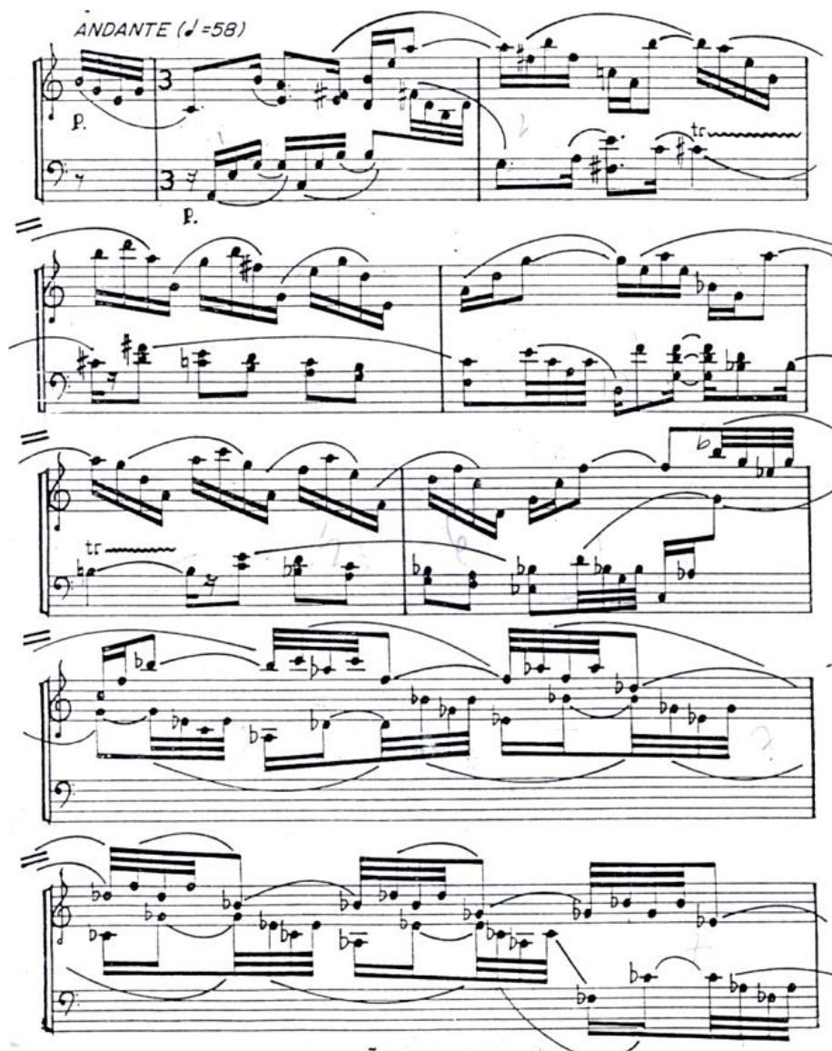
Figure 15: Edino Krieger’s Sonata n° 1 para piano [mm. 1-8]

and sounds downright “carioca” to the ear. The pace of EK 1 is fluid and the mood pleasant. It is lively without any trace of anxiety; a hint of melancholy furnishes just the right amount of elegance. It anticipates Bossa Nova by a few years as the figures in alternation create an effortless albeit characteristic “ginga” 62 . As the sidewalk in Copacabana, motion is created by the soft waves of arpeggios moving seamlessly towards the next beat.