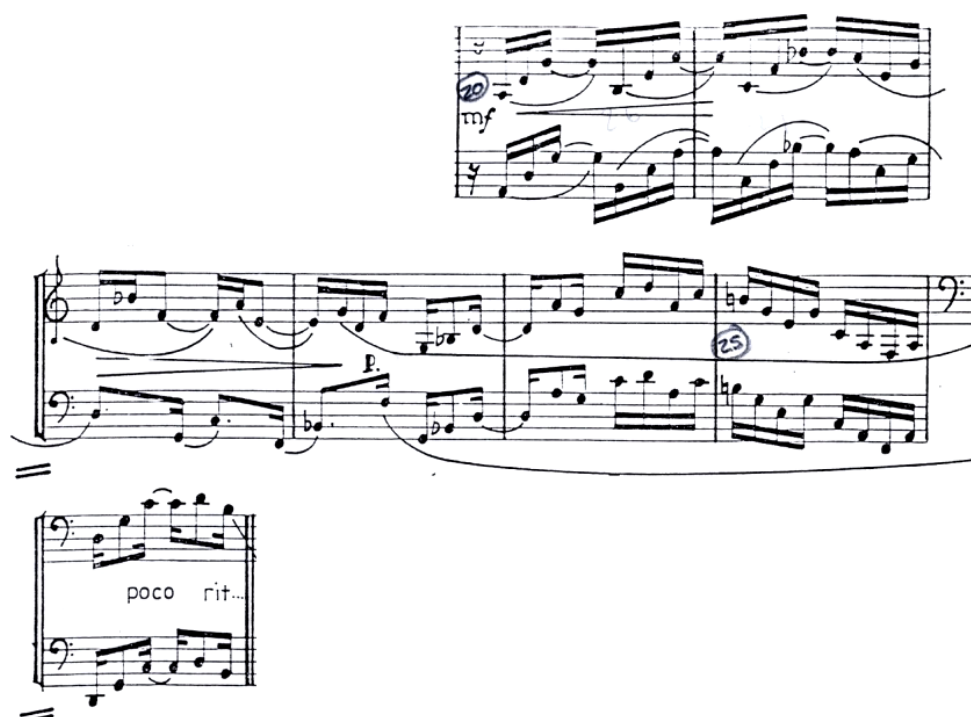
Figure 17: Edino Krieger's First Piano Sonata , unison passage [mm. 20-25]

As exemplified in Fig. 16, Guerra-Peixe seldom uses unison figurations in this particular movement. In this respect [m. 13] is almost an exception, whereas Krieger resorts to more extensive unison figurations once the theme is fully presented. EK 1, after exploring various modes of imitation, reintroduces the theme in unison as a compositional variant (Fig. 17).