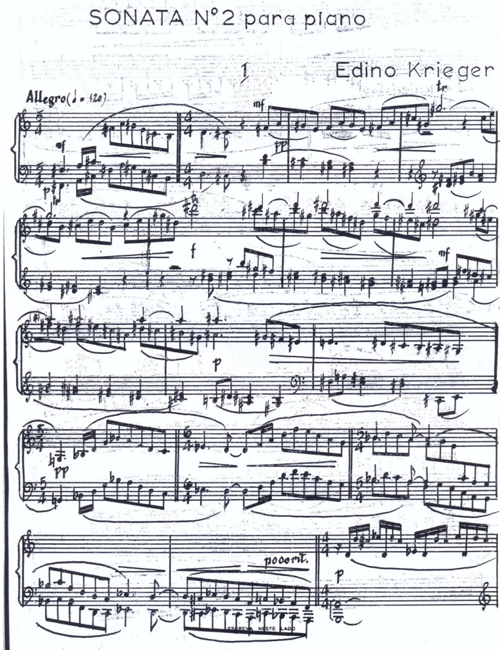
Figure 12: Krieger's Second Piano Sonata [mm. 1-17]

Before proceeding, it is essential to consider that the five works so far mentioned sound heroic but not particularly imbued with specific elements originating from national character. On the contrary, composers have striven to ascertain the paternal ascendancy from European provenance and to develop a musical decorum akin to a higher style 54 of learned counterpoint and motivic elaboration. Let's keep this in mind as the contrast with the following work