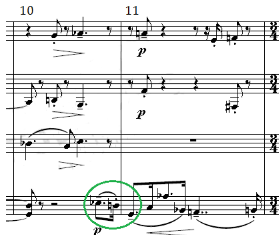
Example 3: Bars 10 and 11 – Development of the first motif

A second transformation of the first motif appears at bar 17 (Example 4), now presented as a triplet with E natural rather than E flat. Important to notice that two more pitches will be ordered in the same order of the phrase of the beginning: Ab and Bb. In addition, the triplet figure that follows organizes the phrase in the same way of the very beginning of the work, creating an expected opposition.