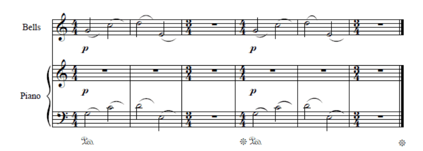
Example 3: First thematic motive, based on the monogram of Gidon Kremer's name, appears in between of pauses, Violin Concerto No. 4 (1984)/I (mm. 1–6)

In the fourth violin concerto (Ex. 3), the first thematic motif, which derives from the monogram of the violinist Gidon Kremer (G–C–D–E), appears within a silent atmosphere and is completed amid pauses. The orchestration, the brevity of this thematic motif, and its nature as a monogram enhance its function as a birth of a sonic entity amid silence. This effect is also intense in the Viola Concerto discussed above (see Ex. 2). The beginning of this concerto can be associated to Peer Gynt's Prologue "into the world" (1987) (Weitzeman 1994, p. 13) as both works open with the succession of the same intervals: a ninth and a seventh. This treatment provides spatial, symbolic, and ontological effects. The octave seems to act as a sort of equilibrium which is undermined both by the desire to outstrip it (ninth) and the impotence to reach it (seventh). We suggest that the silent surroundings and the musical utterance amid pauses reinforce the sense of something that is both felt and known and at the same time remains unattainable. This connects with the "mystical element" which, according to Wittgenstein, is "the sense of the world as a confined whole" (Wittgenstein 1978, p. 130).