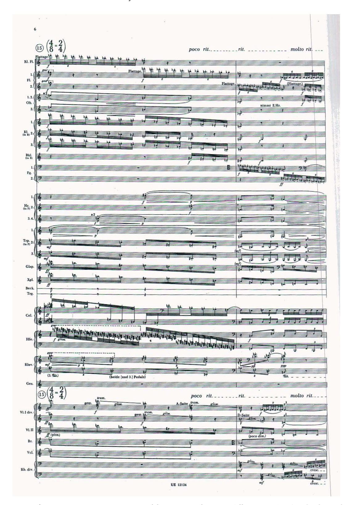
Example 6: Disintegrative ostinato-like motivic lines in Alban Berg's Five Orchestral Songs after Postcards by Peter Altenberg , Op. 4 (1912) (mm. 15–16)

Revista da Associação Brasileira de Teoria e Análise Musical 2021, v. 6, n. 2, p. 96–139 – Journal of the Brazilian Society for Music Theory and Analysis @ TeMA 2021 – ISSN 2525-5541