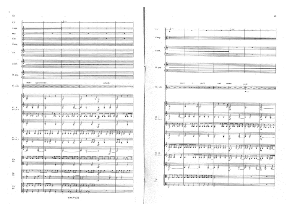
Example 5: Violin Concerto No. 4/III (1984) (mm. 298–302)

Berg's technique, following "a predetermined tendency towards disintegration which extends to orchestration" (Adorno 1994, p. 66) in combination with Shostakovich's "deaf voices", acquires a renewed developmental force with extra-musical dimensions. In fact, the deaf parallel and repetitive vocal/motivic stratification is incarnated both in Berg's exceptionally elaborative, elusive, and less pictorial manners and in "Shostakovichian grandiose logic" constituting a common developmental logic. Schnittke detects this fundamental logic between the two composers, incorporating them combinatorially in his own work. In the second movement of the composer's third violin concerto, this logic is reinforced by techniques which intensify the chaotic sense (Ex. 7). At the same time, in the third and the fourth violin concertos, the merging of "deaf voices" into unison takes place.