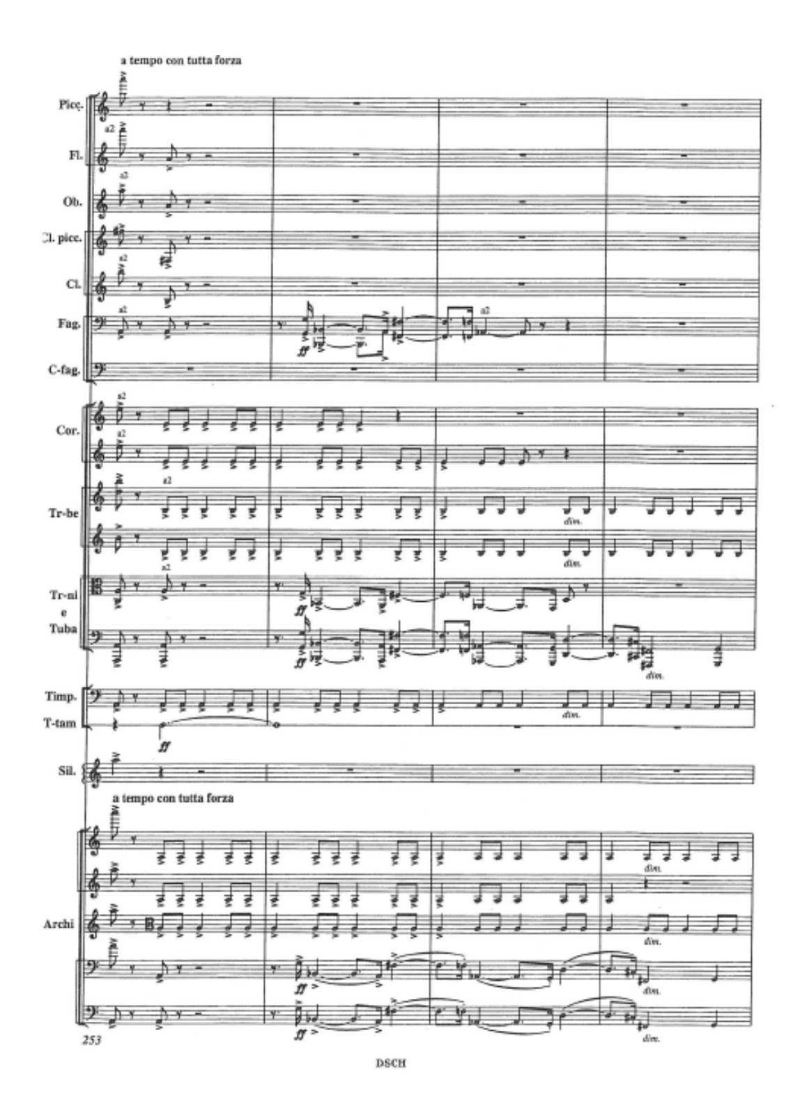
Example 4: Shostakovich, Symphony No. 5/I (mm. 253–256)