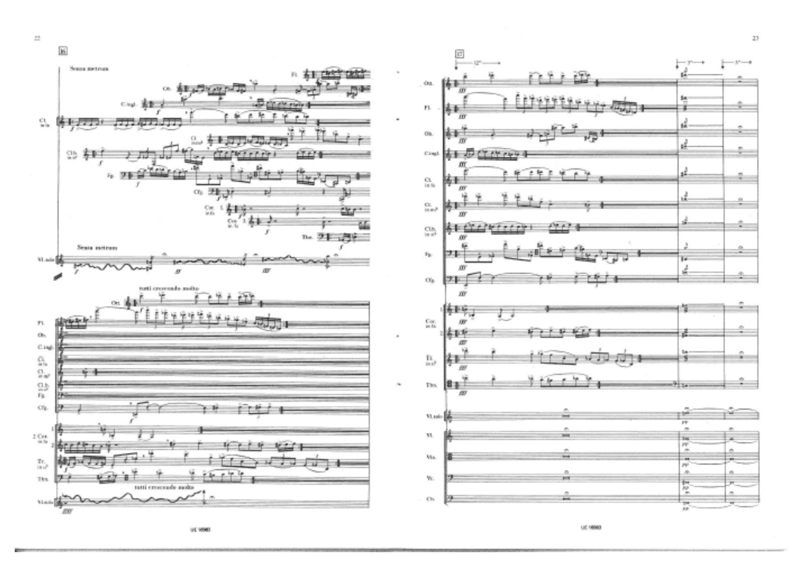
Example 7: Incoherent repetitive motivic lines, Violin Concerto No. 3/II (mm. 160–166)

We support that Schnittke maximizes the techniques of Shostakovich and Berg, in four main ways: