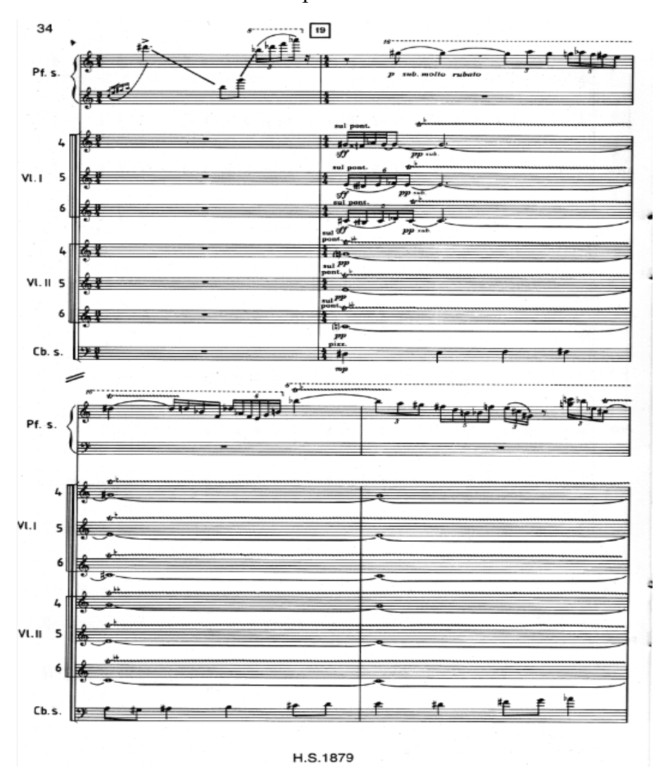
Example 8: "Jazz variation" based on the intervals of Bach's monogram, Concerto for Piano and Strings (1979) (mm.188–191)

Along with these four practices, an additional developmental practice frequently completes the composer's developmental techniques, which we codify as "Polystylistic variations". These appear as a sequence of stylistic areas, in which the thematic material is reflected through various prisms. "Polystylistic variations" function as a necessary ingredient to bring about a completed material's wandering, deepening, and deconstruction. Following "dreamy-converting procedures" (Schnittke 1994, p. 96), stylistic areas substitute the harmonic areas and modify the main structural divisions of the section, they highlight the narrative approach of the sonata as an adventure, and offer modernization as well as immediate representational effects.