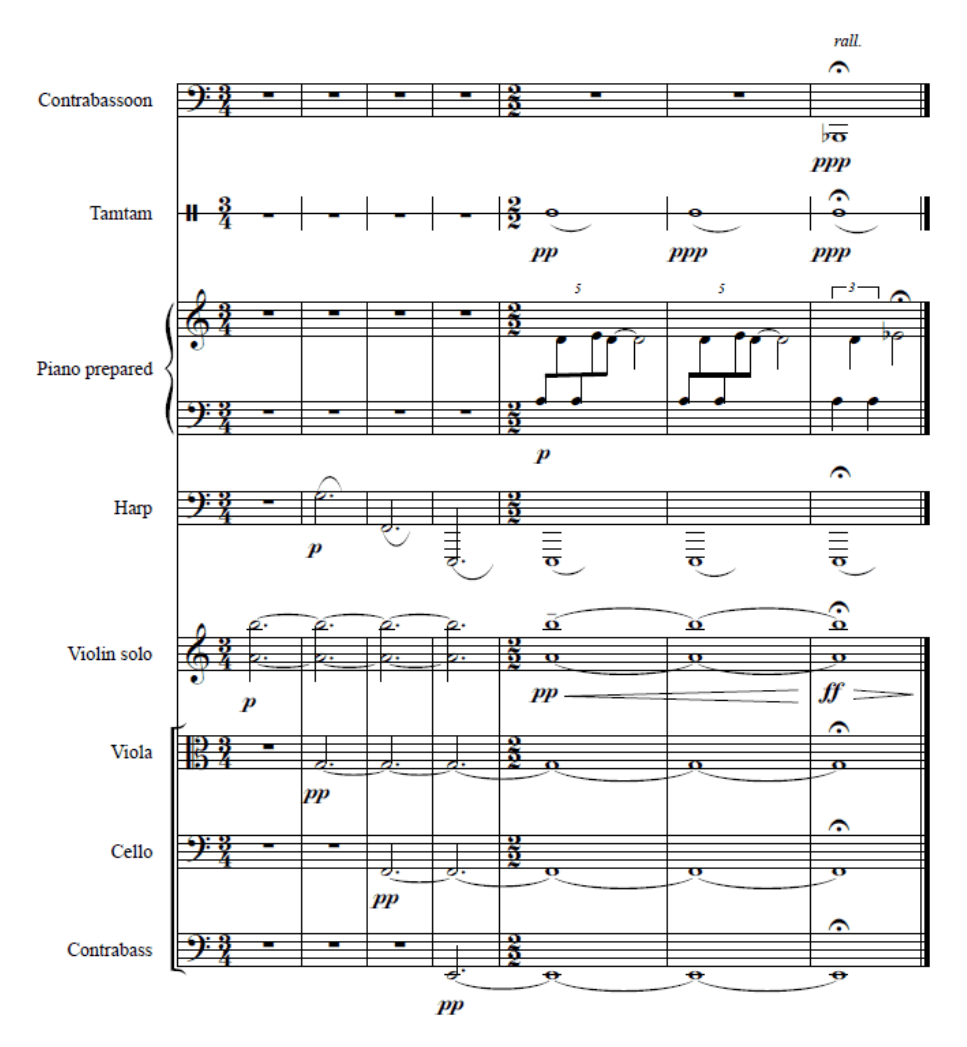
Example 10: Last bars of the Violin Concerto No. 4/IV: a "lingering" finale

form's recapitulation. This exhaustion is represented through particular strategies which appear almost identical in the majority of Schnittke's last movements. It is mainly carried through by means of sparse orchestration, timbre, texture, low dynamics, slow tempo, as well as a specific use of register and sound effects associated with the solo instruments. Ex. 10 brings an instance of this procedure in the Finale of his Violin Concerto No. 4.